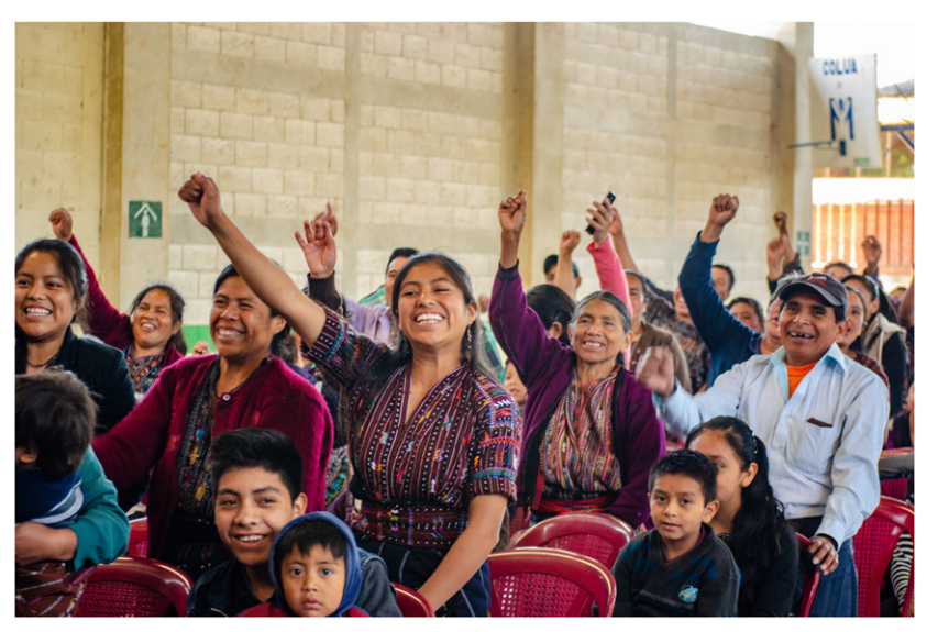
Figure 3 Family and friends participating in an activity as part of the public sharing for the culminating 12-session Vocal Empowerment Curriculum.