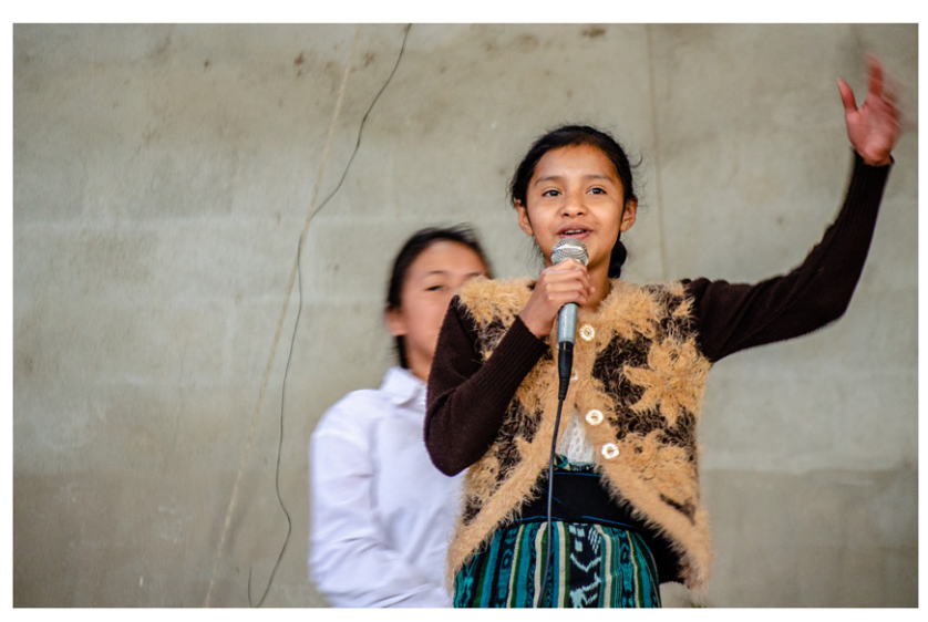
Figure I A MAIA Impact student sharing her personal declaration at the public sharing for the culmination of the I2-session Vocal Empowerment Curriculum.

Guatemala, to provide educational opportunities for young Maya women from low-income, traditionally marginalised communities. MAIA transitioned from primarily an educational mentorship programme from 2008 to 2017 to an organisation that created its own MAIA Impact School, which represents Guatemala's first academically rigorous twenty-firstcentury secondary school designed, led, and run by Indigenous women for Indigenous women. In the Guatemalan National Maternal and Child Health Poll (2017), of the women aged 15-49 surveyed in Sololá (where the school is located) only 6.5% had completed secondary school, demonstrating the urgency of MAIA's efforts (Ministerio de Salud Pública y Asistencia Social et al. 2017, p. 33). The creation of the MAIA Impact school sought to close this educational gap. A representative MAIA student is exceptional both in academic achievement and in her ability to convey her drive, commitment, resilience, and fortitude. These girls are described by MAIA as 'pioneers' as they are charting a new path for Indigenous females in Guatemala.